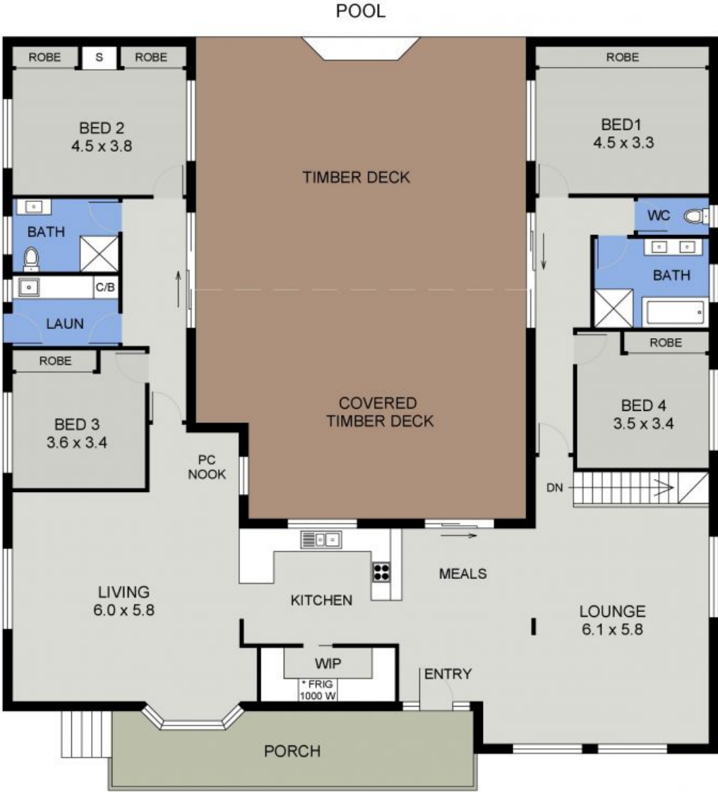
MAIN FLOOR PLAN ( 228 sq m Approx )