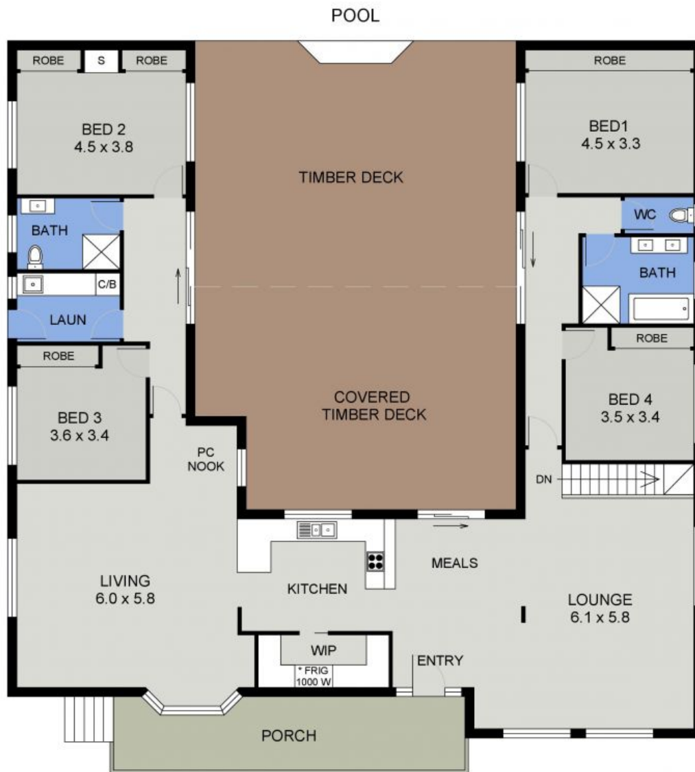
MAIN FLOOR PLAN ( 228 sq m Approx )