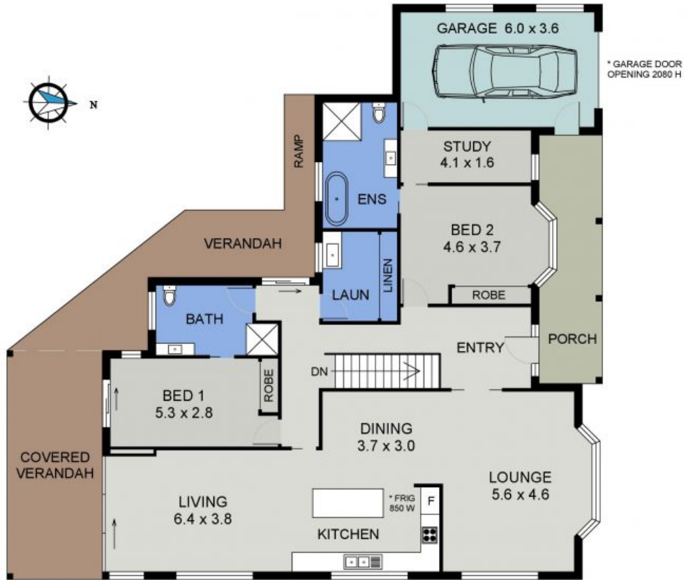
UPPER FLOOR PLAN ( 197 sq m Approx )