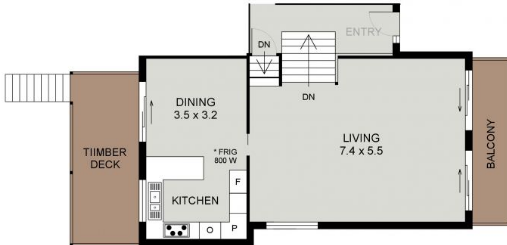
UPPER FLOOR PLAN ( 70 sq m Approx )