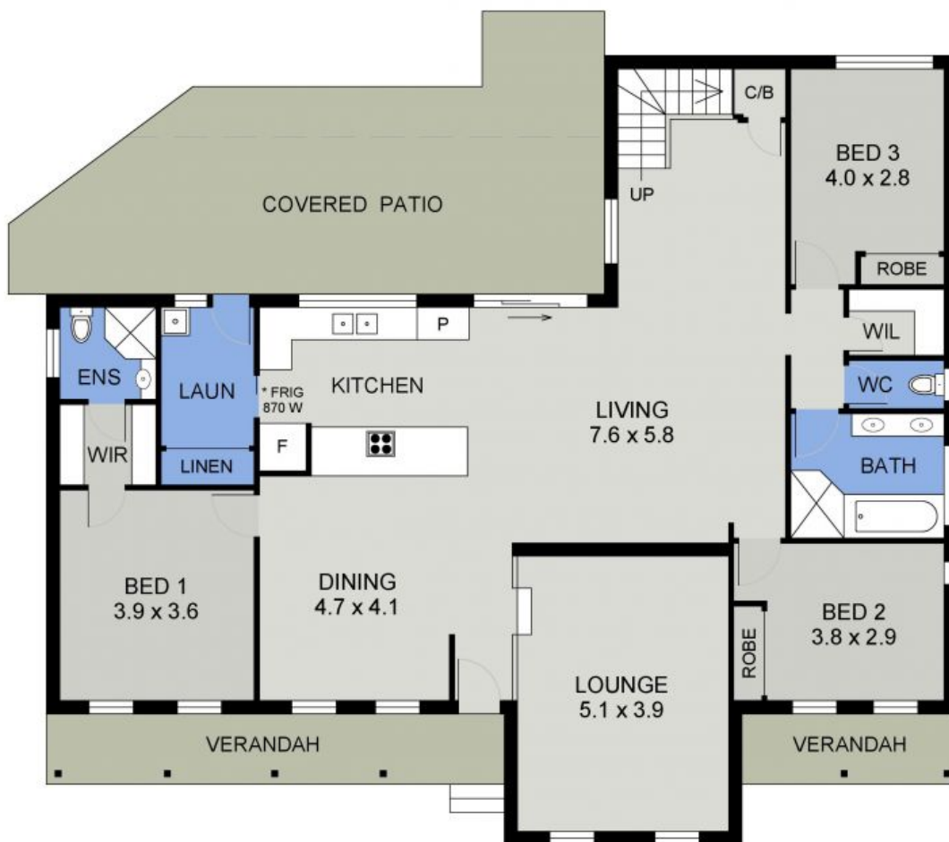
MAIN FLOOR PLAN ( 170 sq m Approx )