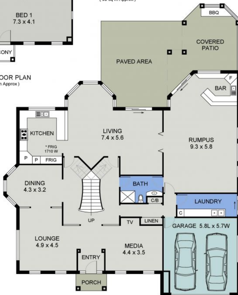
19 ELKHORN GROVE PORT MACQUARIE