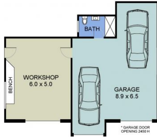
SEPARATE GARAGE / WORKSHOP ( 95 sq m Approx )