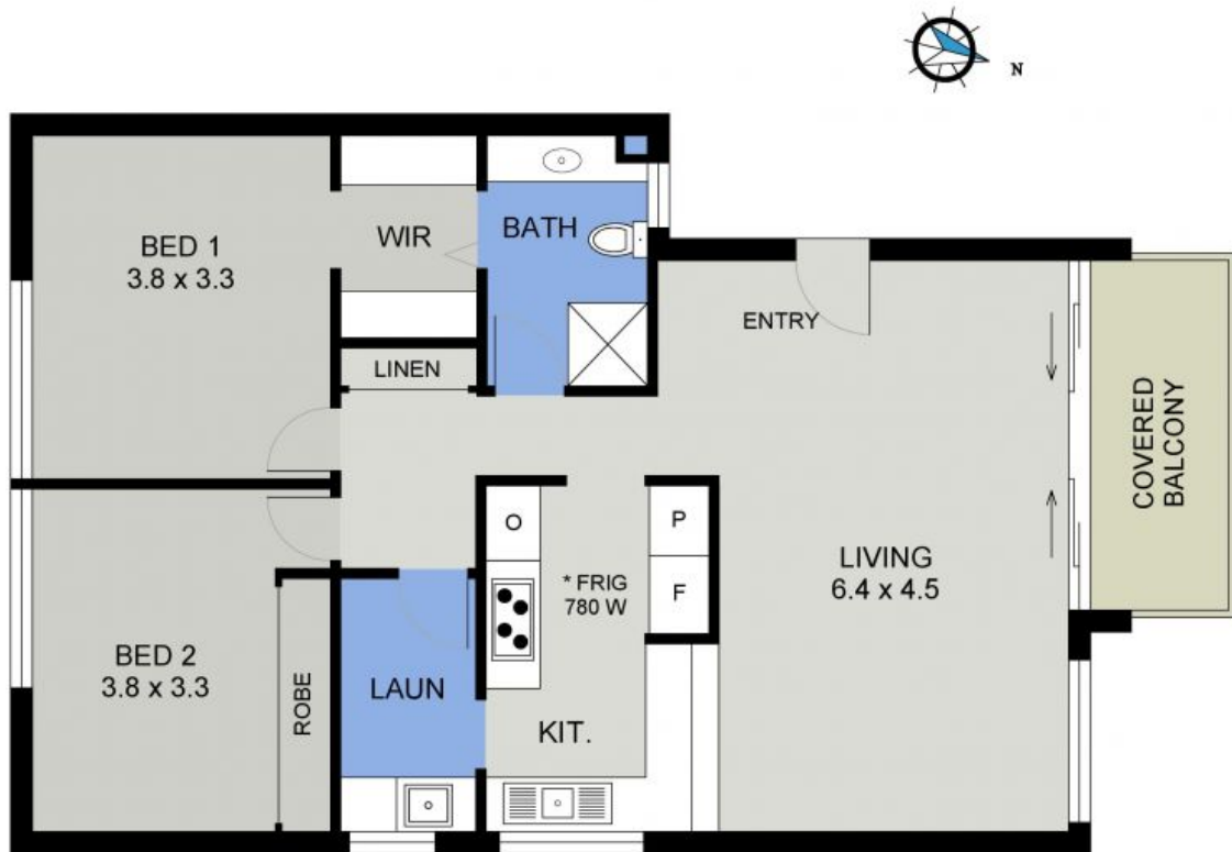
FLOOR PLAN ( 133 sq m Approx )