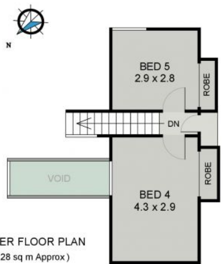
UPPER FLOOR PLAN ( 28 sq m Approx )