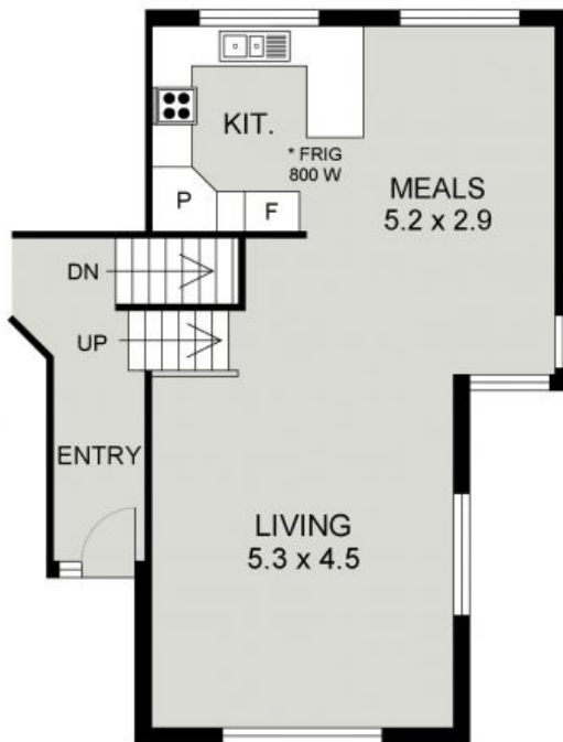
UPPER FLOOR PLAN (61 sq m Approx)