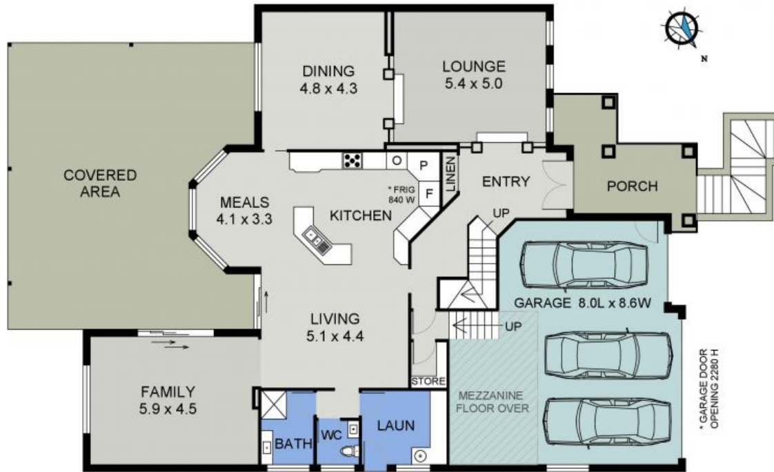
MAIN FLOOR PLAN (255 sq m Approx)