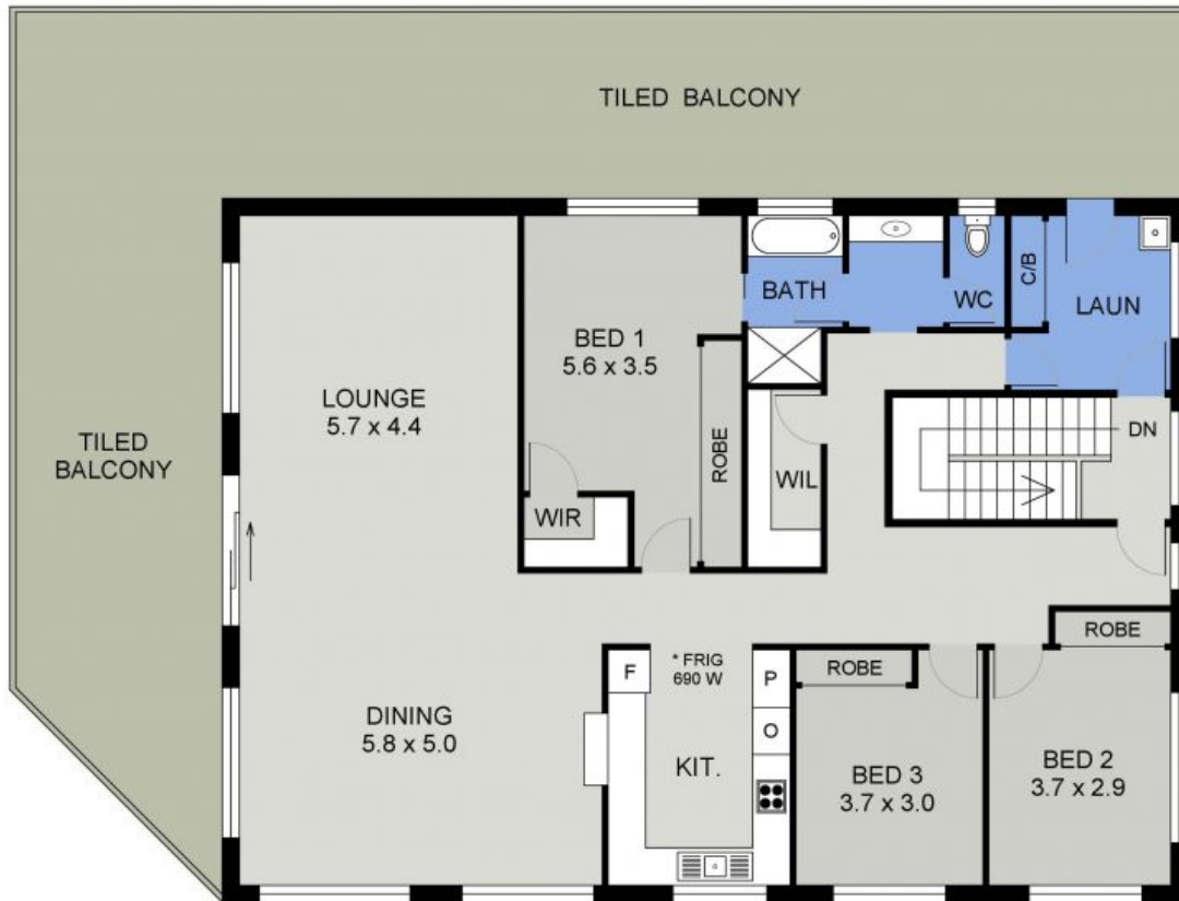
MAIN FLOOR PLAN (173 sq m Approx) Scale - 1:90