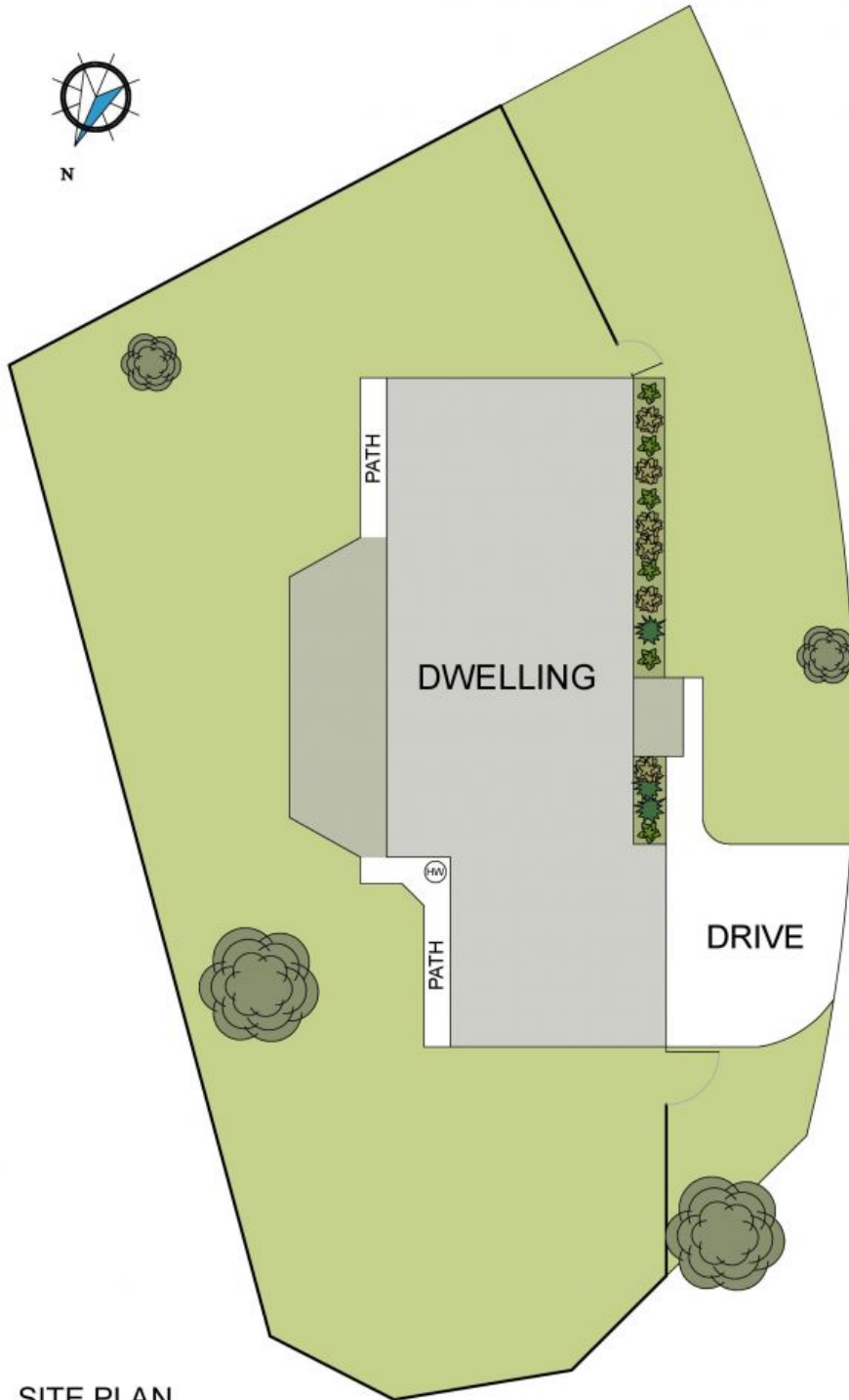
SITE PLAN (Land Size 763 sq m) Scale - 1:170