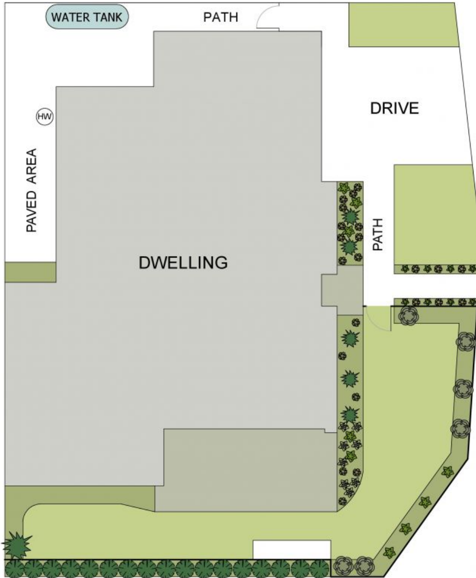
SITE PLAN (Land Size 399 sq m) Scale - 1:110