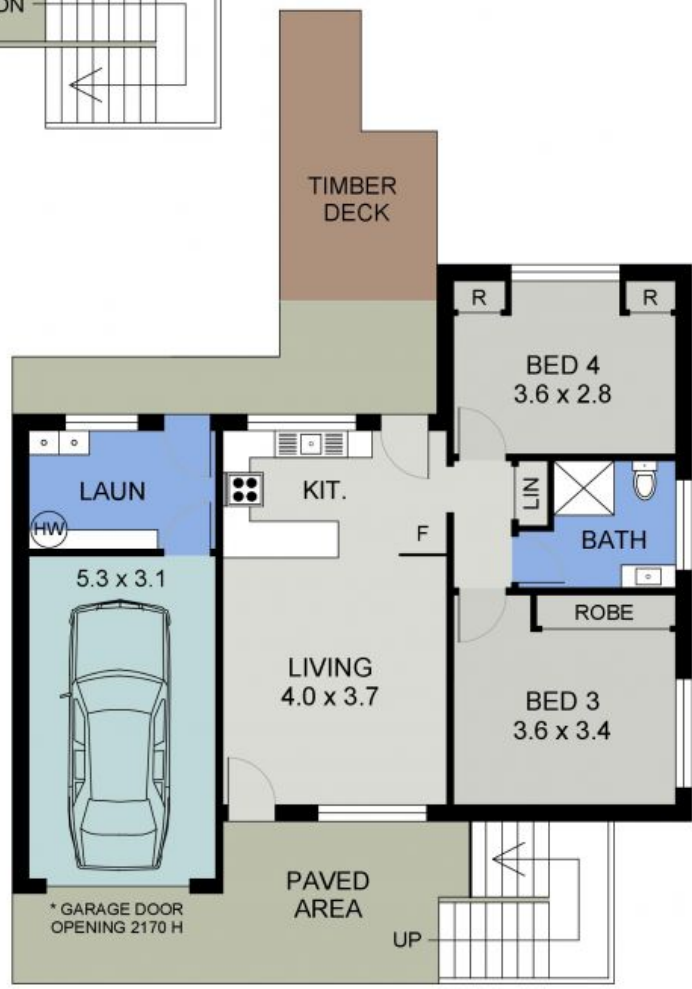
LOWER FLOOR PLAN (90 sq m Approx) Scale - 1:95