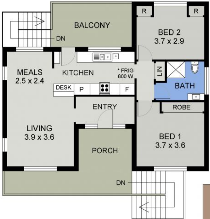
UPPER FLOOR PLAN (79 sq m Approx)