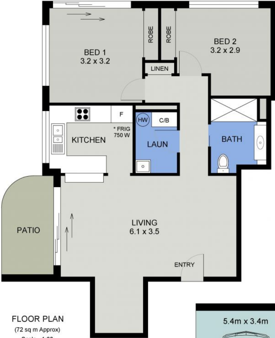
FLOOR PLAN (72 sq m Approx) Scale - 1:60