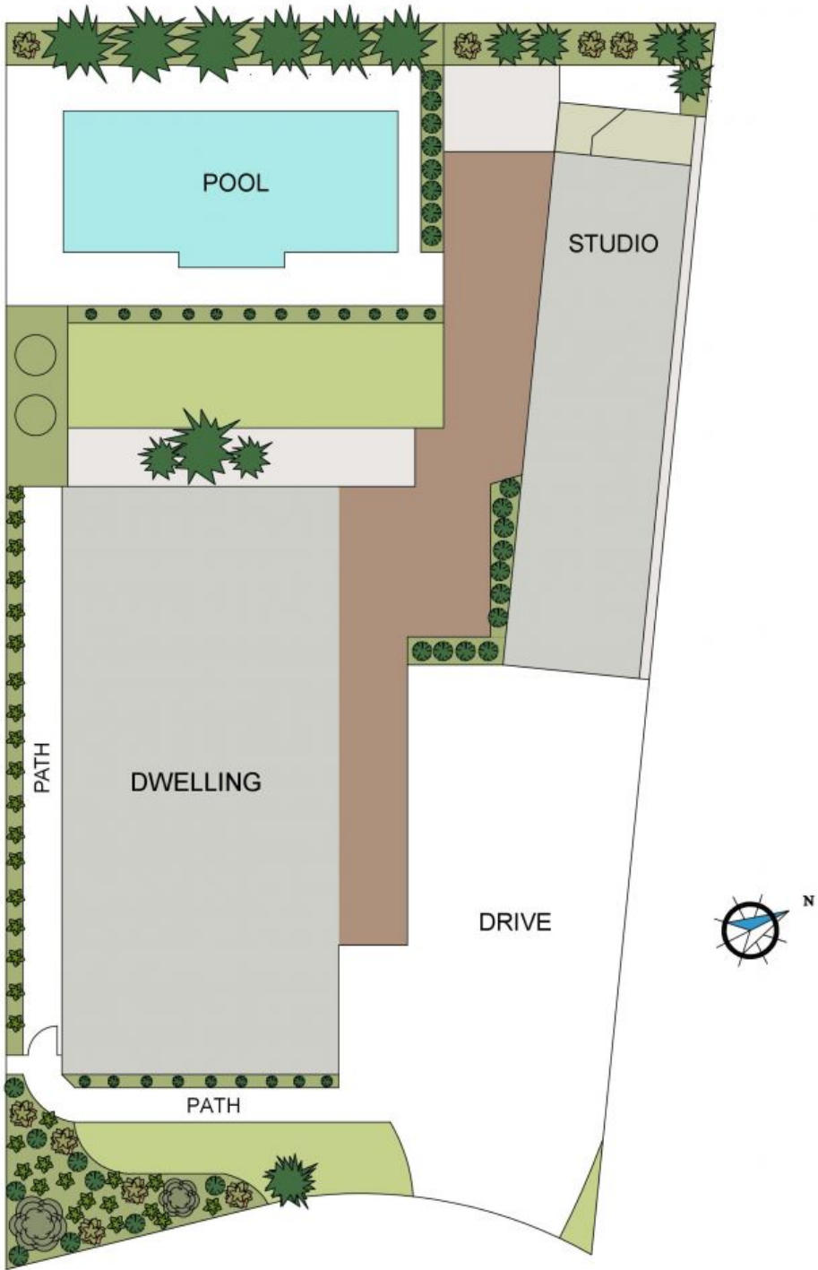
SITE PLAN (Land Size 525 sq m) Scale - 1:135