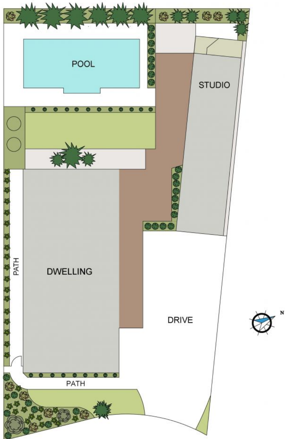
SITE PLAN (Land Size 525 sq m) Scale - 1:135