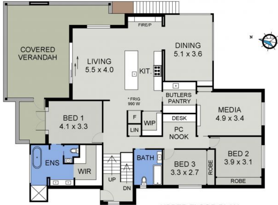
UPPER FLOOR PLAN (198 sq m Approx)