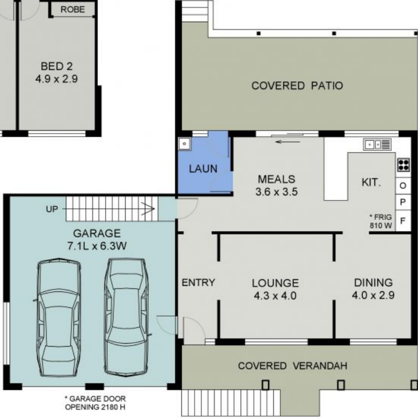
LOWER FLOOR PLAN (125 sq m Approx) Scale - 1:110