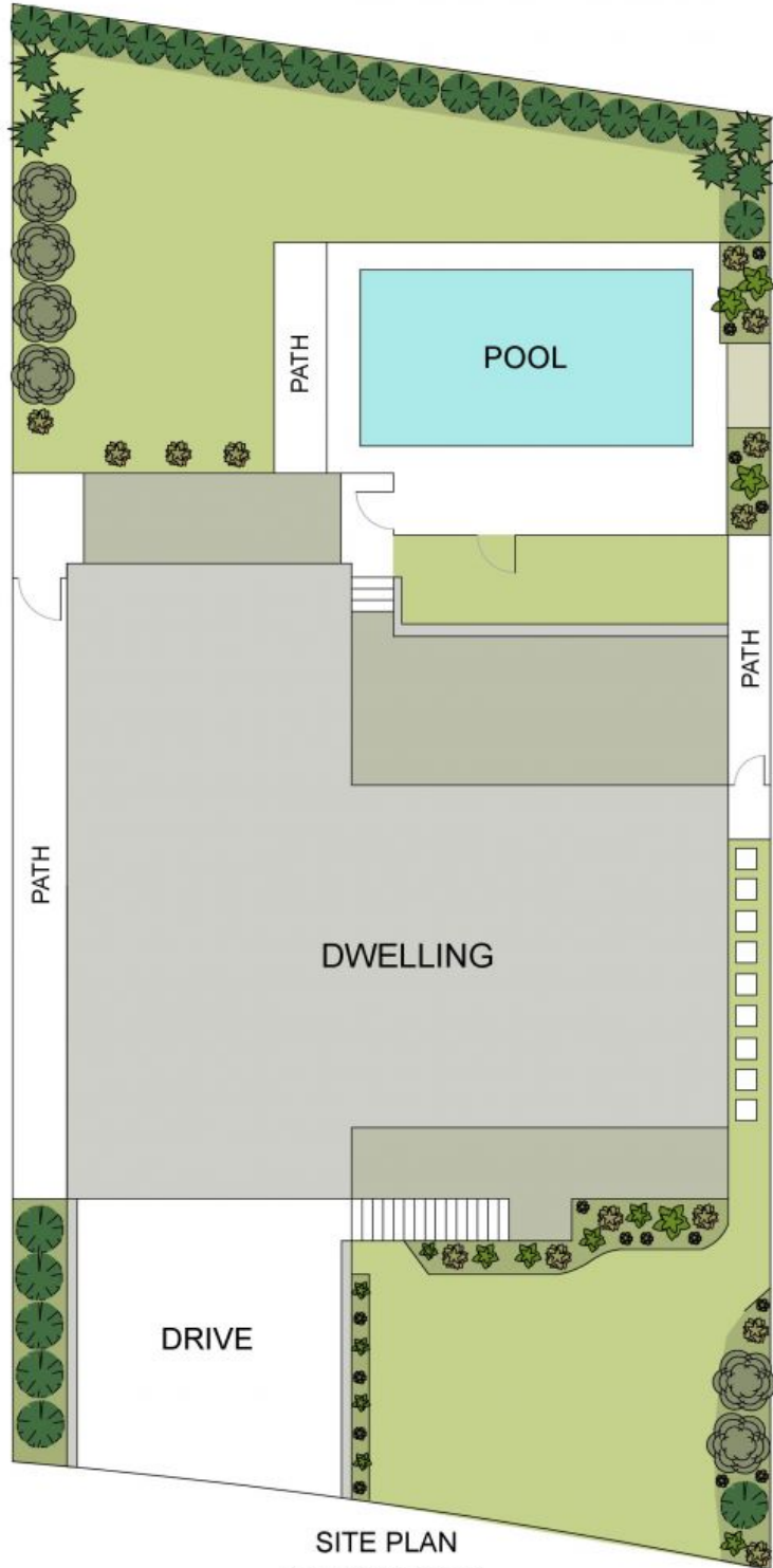
SITE PLAN (Land Size 644 sq m) Scale - 1:145