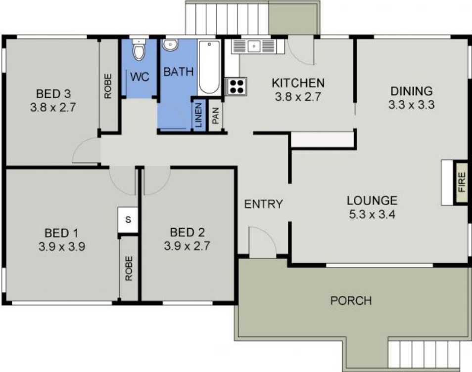
MAIN FLOOR PLAN (106 sq m Approx)