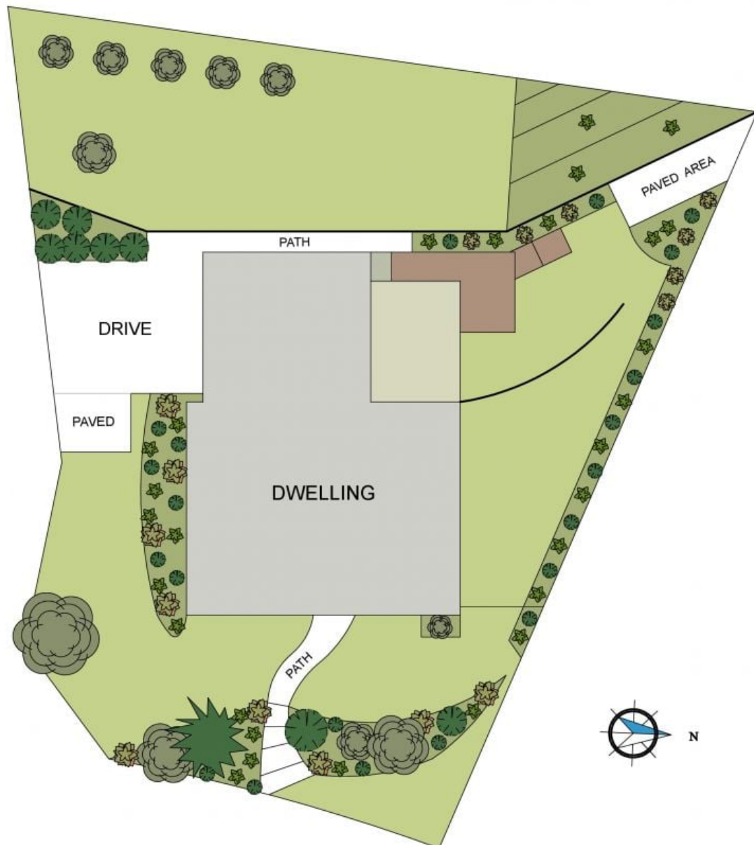
SITE PLAN (Land Size 754 sq m) Scale - 1:165