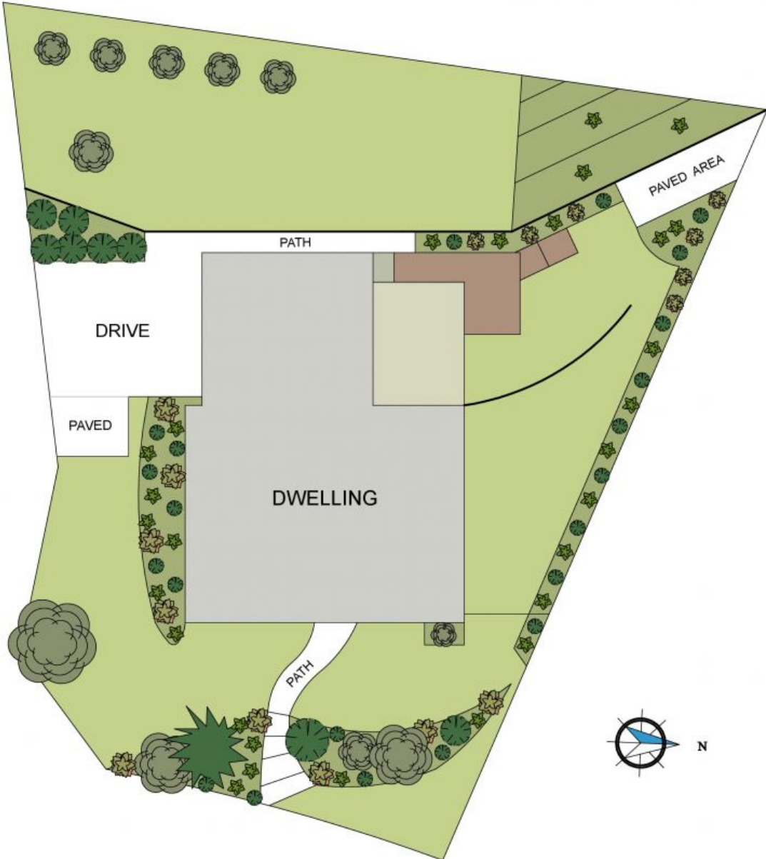
SITE PLAN (Land Size 754 sq m) Scale - 1:165