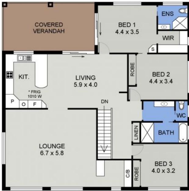
UPPER FLOOR PLAN (171 sq m Approx)