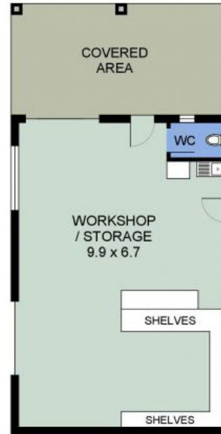
LOWER FLOOR PLAN (72 sq m Approx) Scale - 1:130