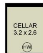
CELLAR UNDER BATHROOM