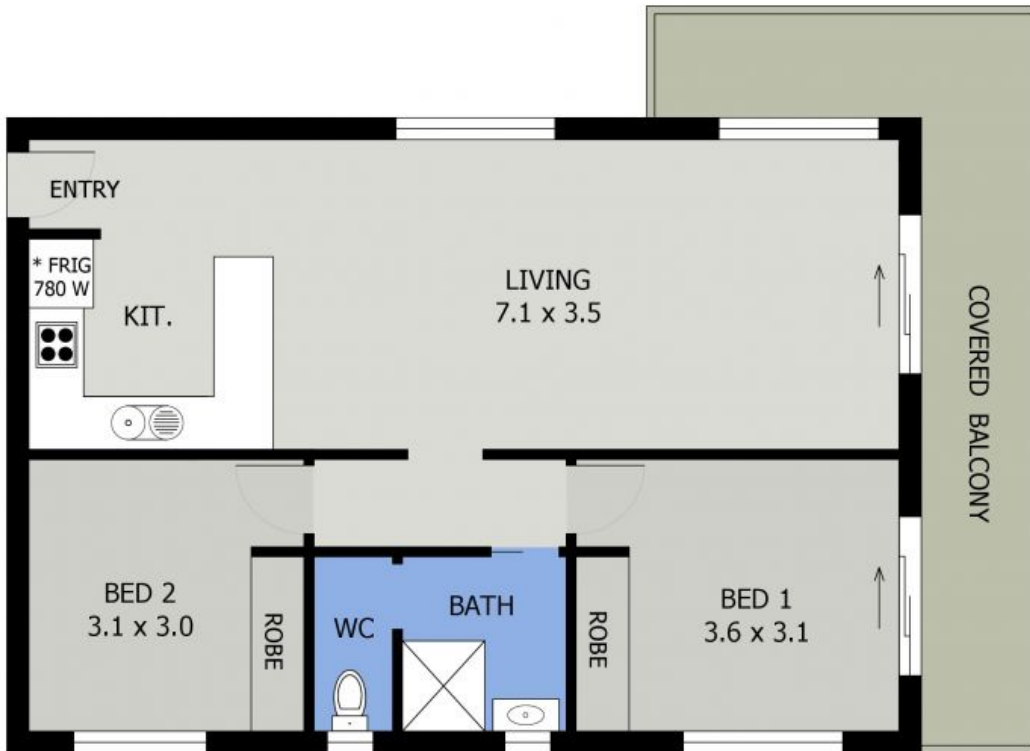
FLOOR PLAN ( 73 sq m Approx ) ( Scale: 1:65 )