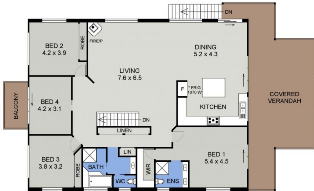
UPPER FLOOR PLAN (204 sq m Approx)