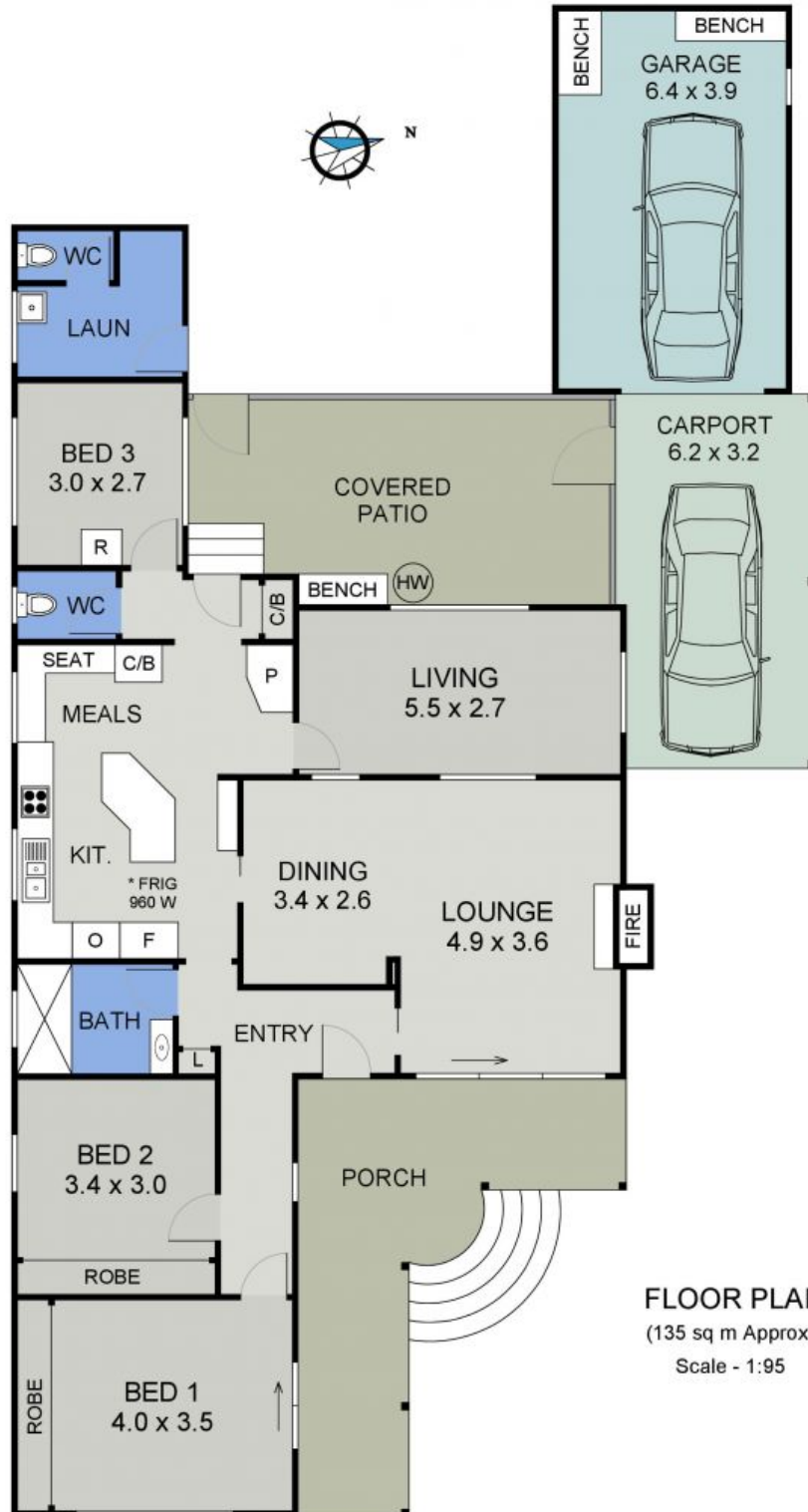
FLOOR PLAN (135 sq m Approx) Scale - 1:95