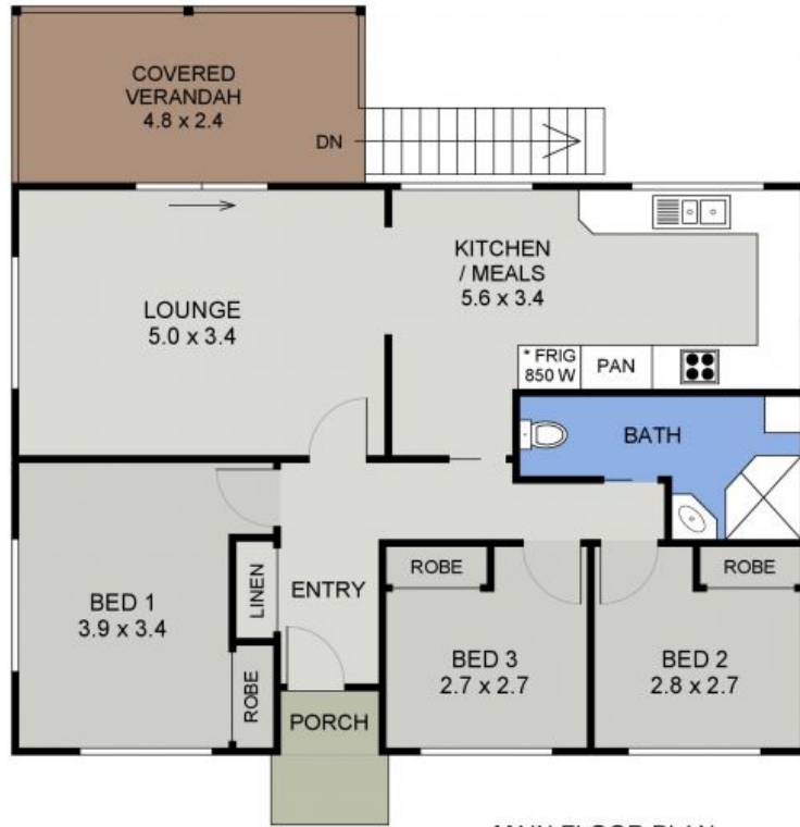
MAIN FLOOR PLAN (83 sq m Approx)