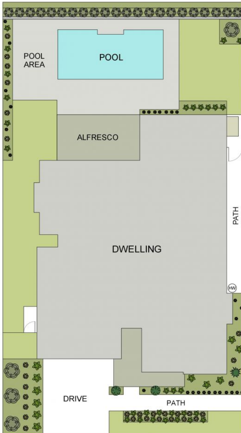
SITE PLAN (621 sq m Approx) Scale - 1:135