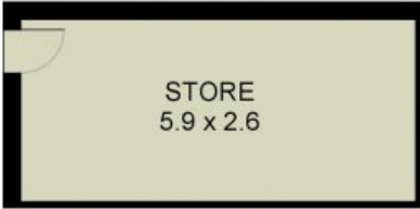
STORAGE UNDER GARAGE