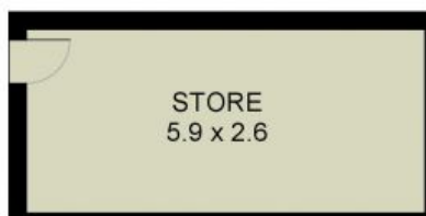
STORAGE UNDER GARAGE