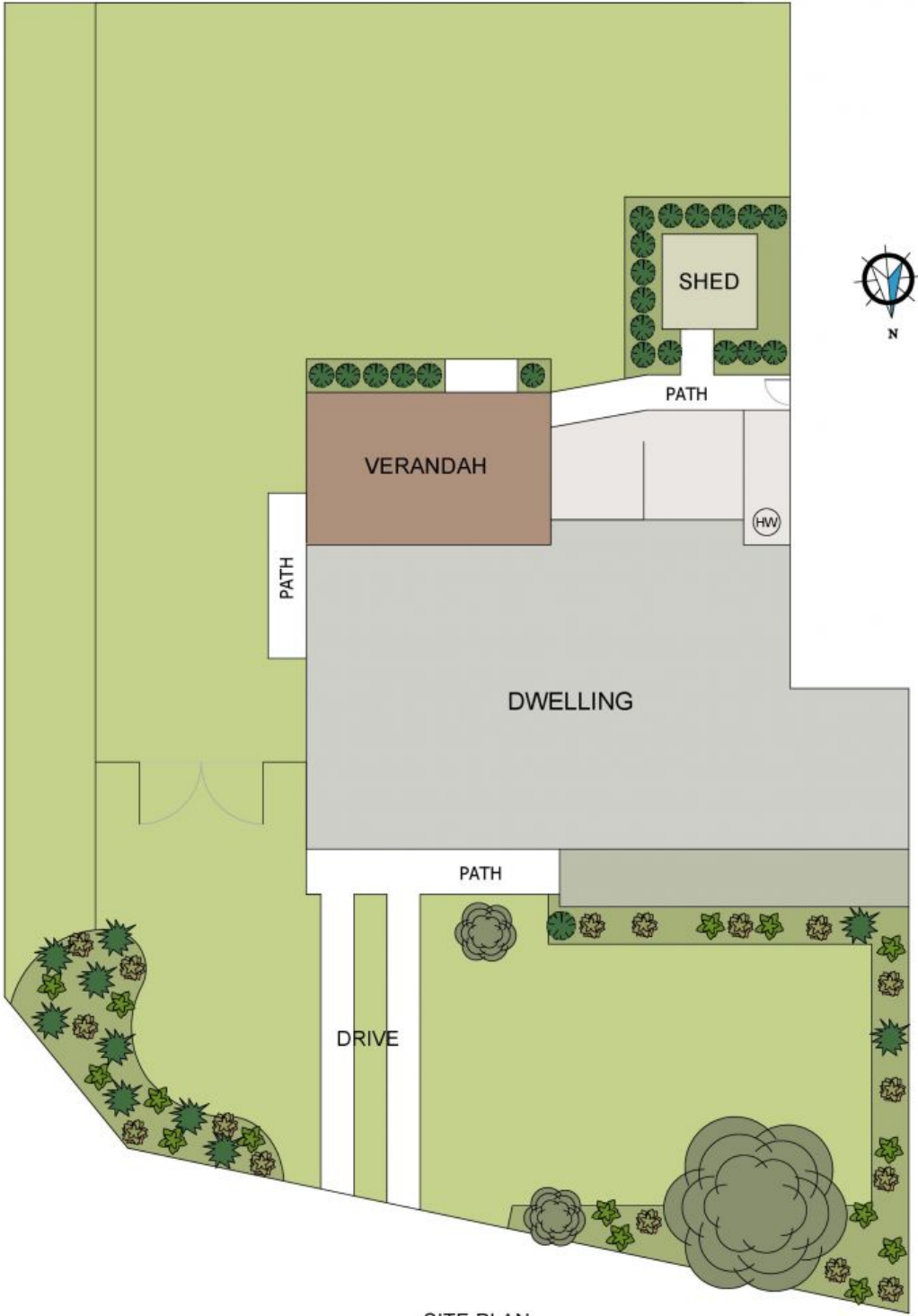
SITE PLAN Scale - 1:125