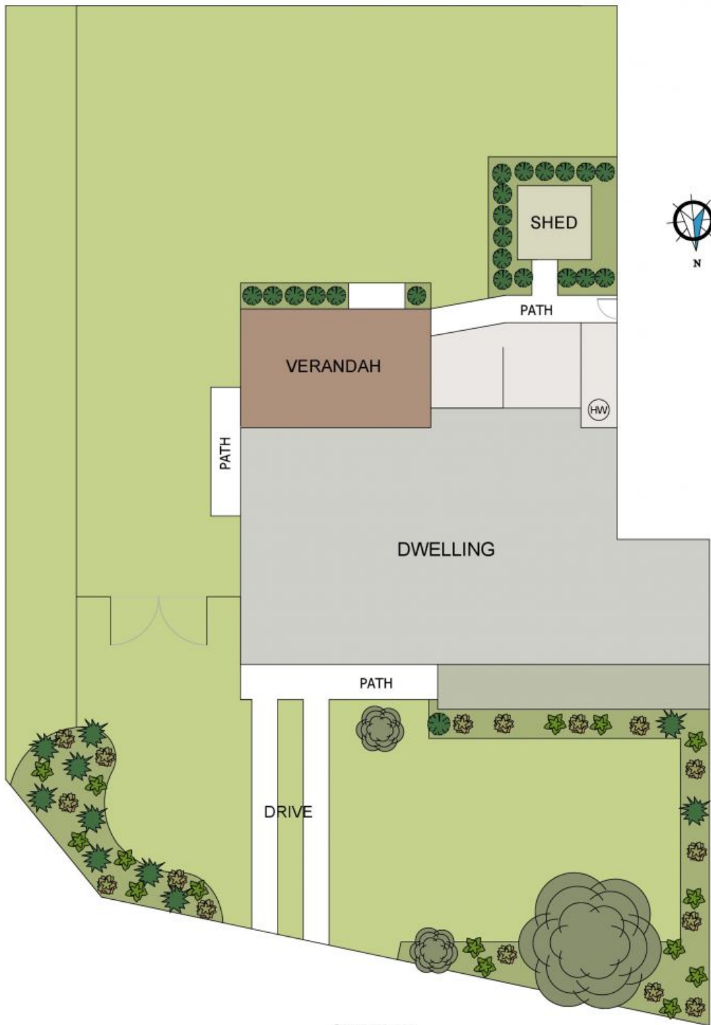
SITE PLAN Scale - 1:125