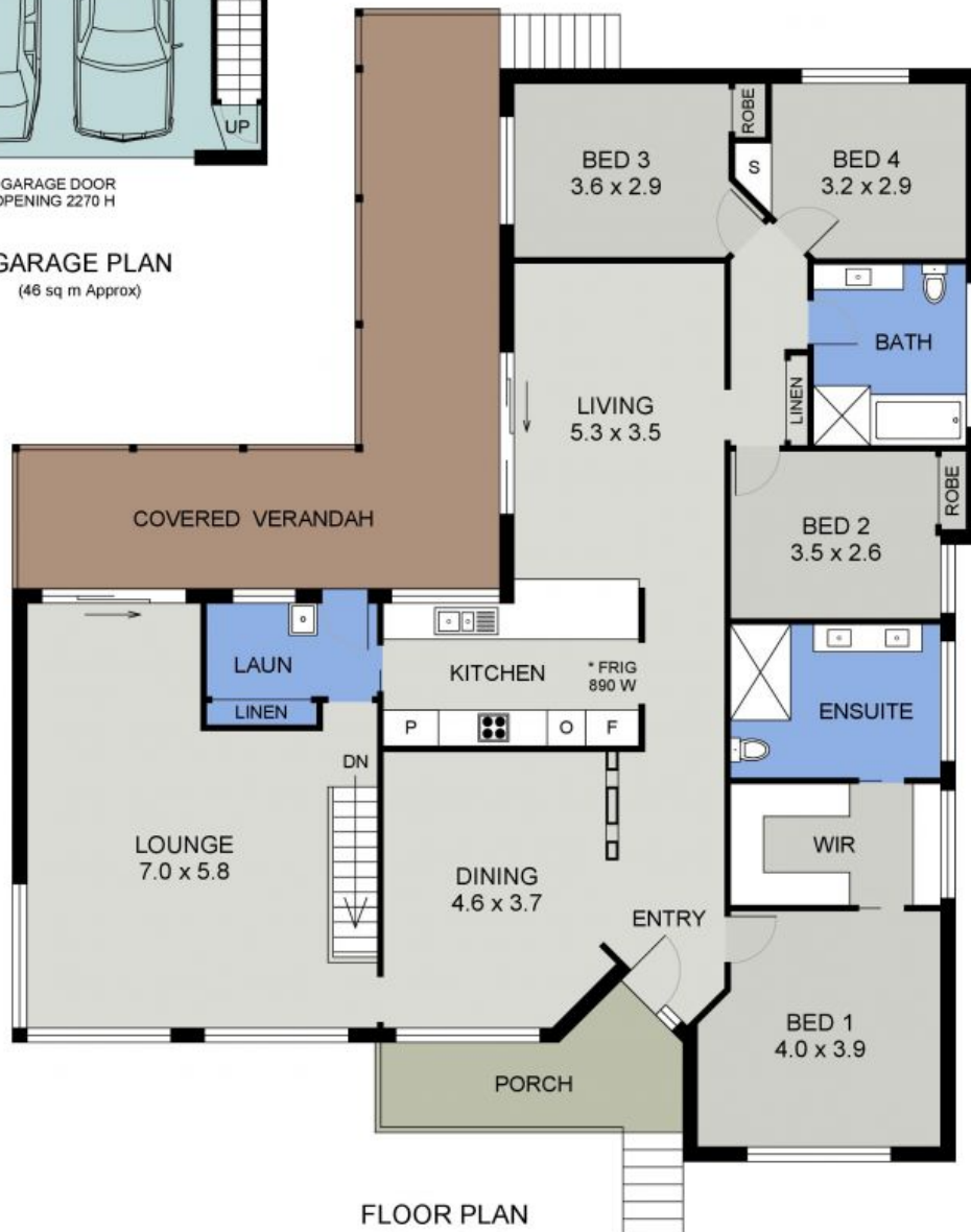
FLOOR PLAN (196 sq m Approx) Scale - 1:100