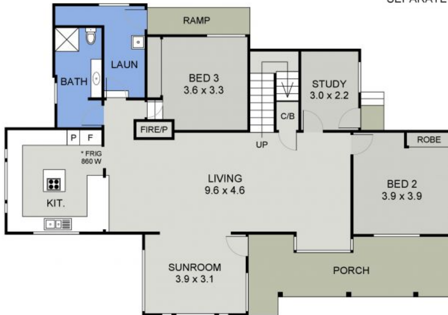
LOWER FLOOR PLAN (133 sq m Approx) Scale - 1:110