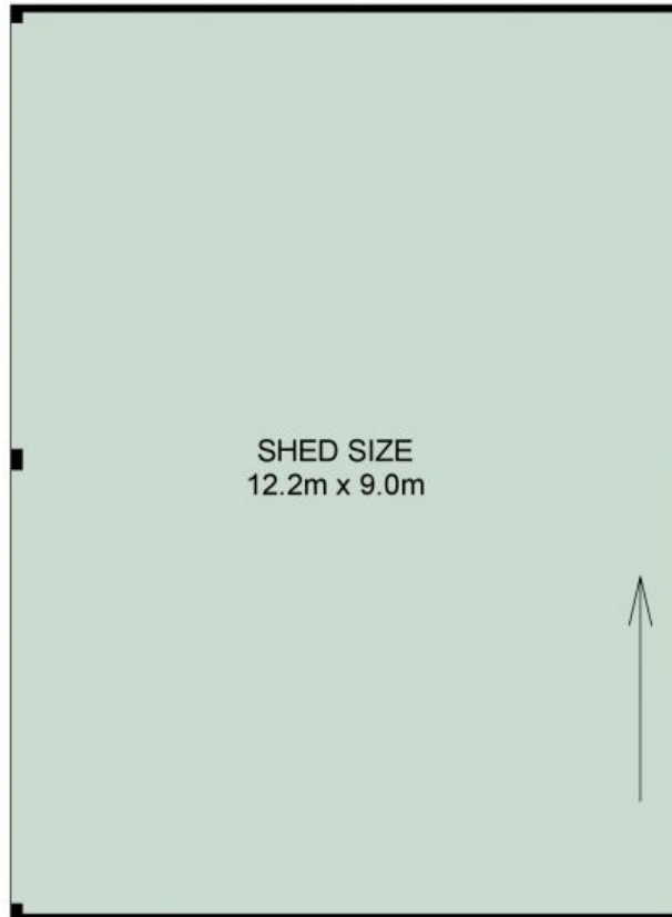
SHED 2 Scale - 1:85