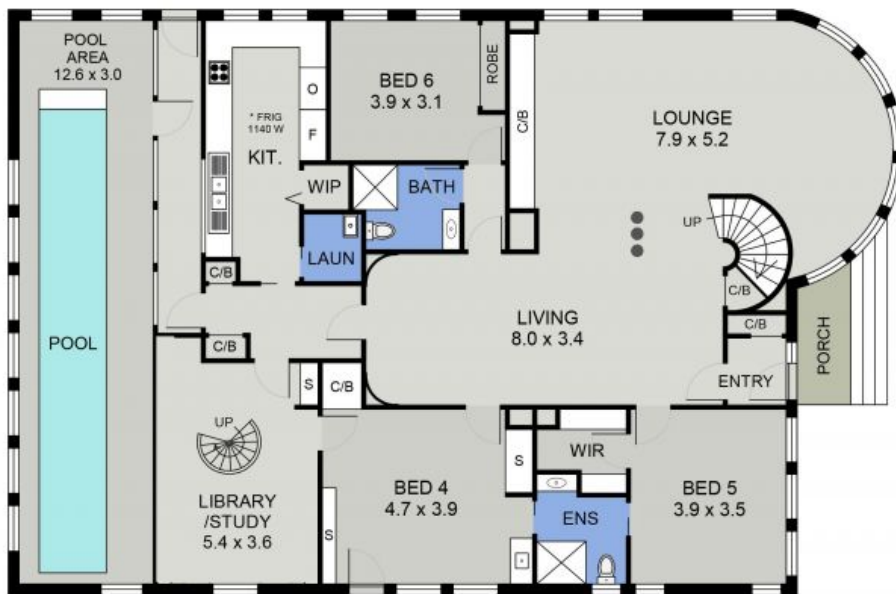
LOWER FLOOR PLAN (240m 2 Approx)