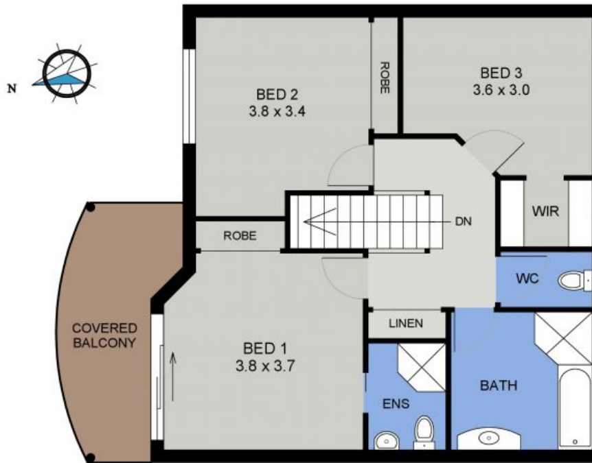
UPPER FLOOR PLAN (67 sq m Approx)