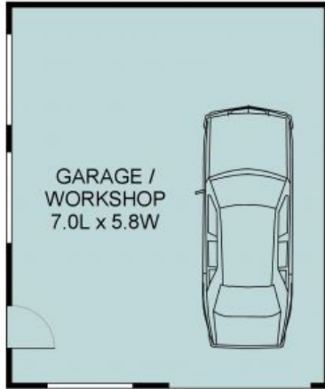
SHED 1 PLAN