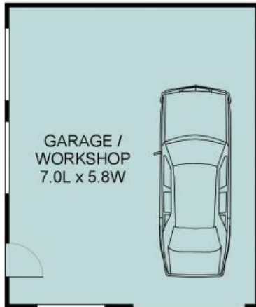
SHED 1 PLAN