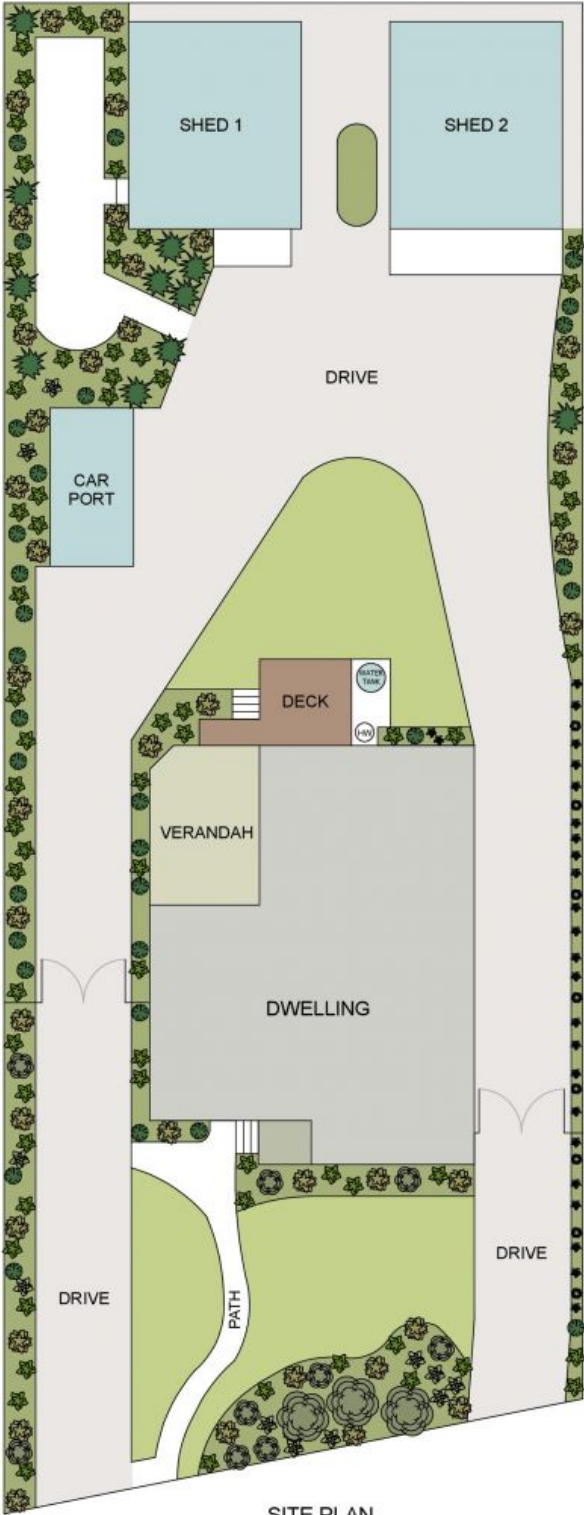
SITE PLAN (1,012 sq m Approx) Scale - 1:200