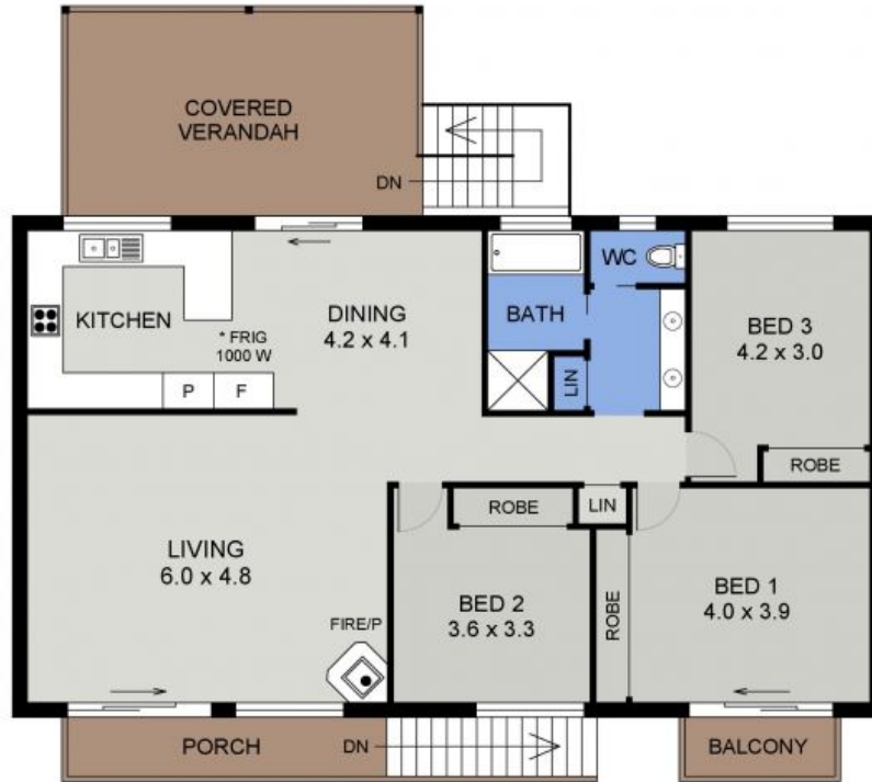
MAIN FLOOR PLAN (121 sq m Approx)