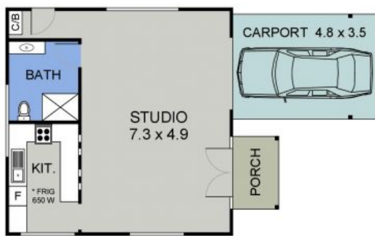
STUDIO PLAN (57 sq m Approx)