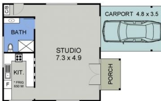
STUDIO PLAN (57 sq m Approx)