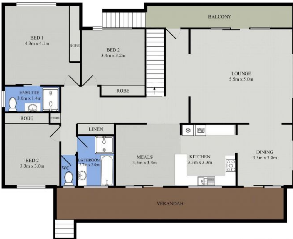
FLOOR PLAN (259 sq m Approx)