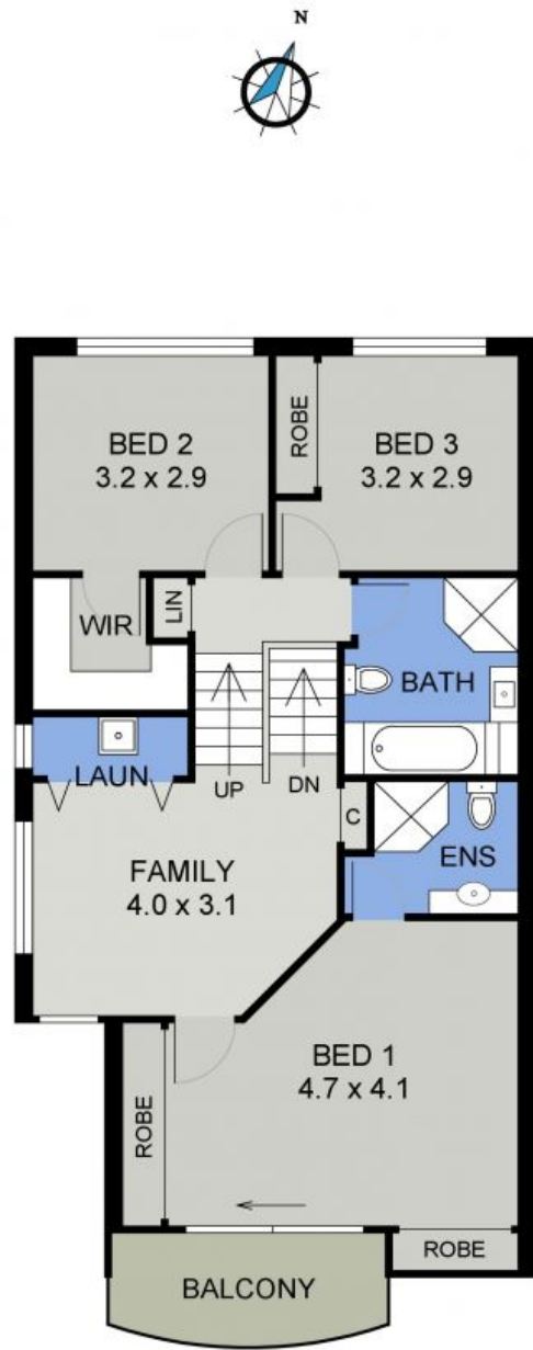
UPPER FLOOR PLAN (80 sq m Approx) Scale - 1:85