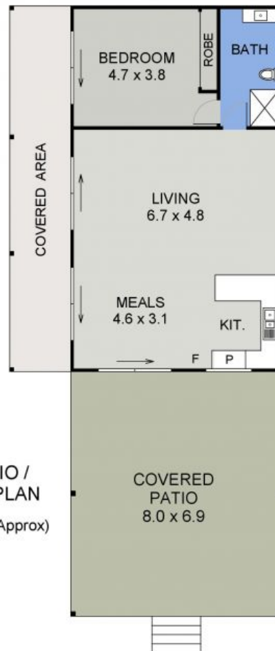
STUDIO / FLAT PLAN (83 sq m Approx)