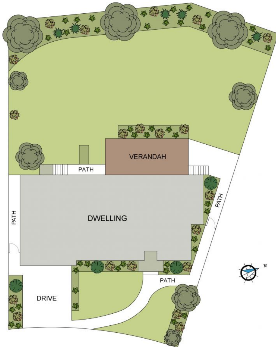
SITE PLAN (769.6 sq m Approx) Scale - 1:155