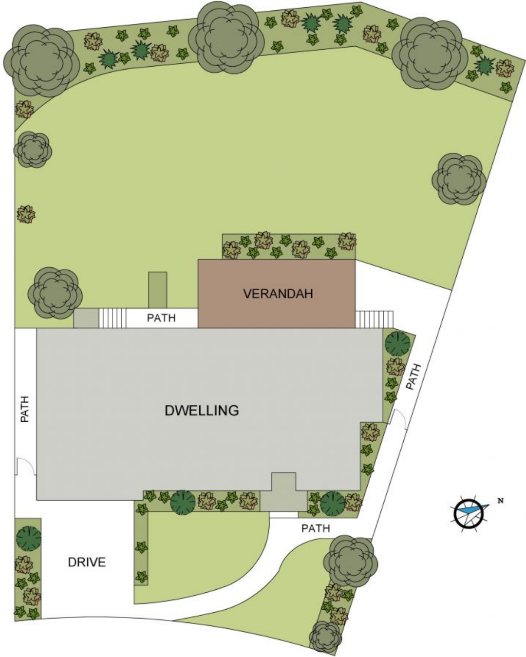
SITE PLAN (769.6 sq m Approx) Scale - 1:155