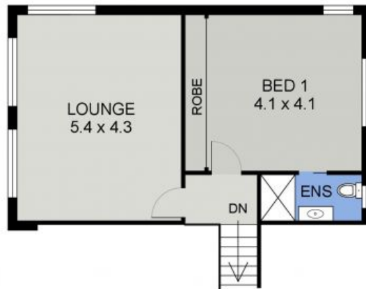
UPPER FLOOR PLAN (55 sq m Approx)