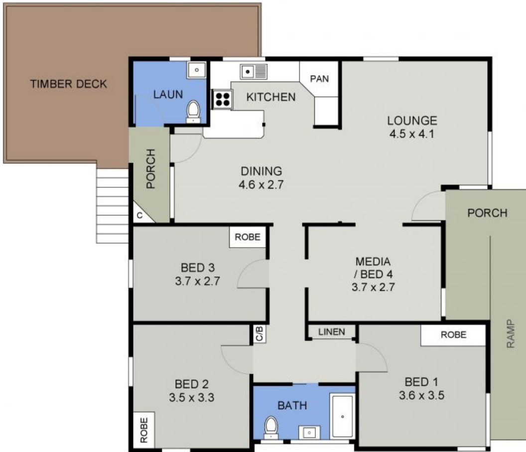
FLOOR PLAN (103 sq m Approx)