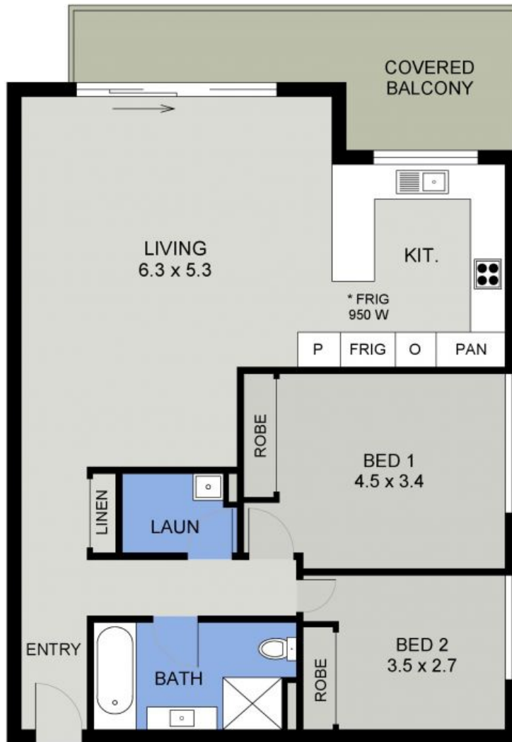
FLOOR PLAN (92 sq m Approx) Scale - 1:70