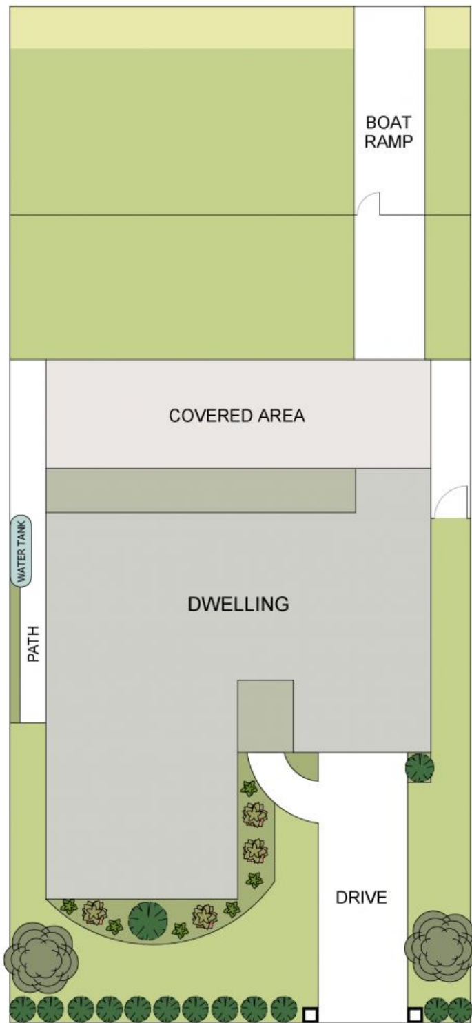
SITE PLAN (758.5 sq m Approx) Scale - 1:160