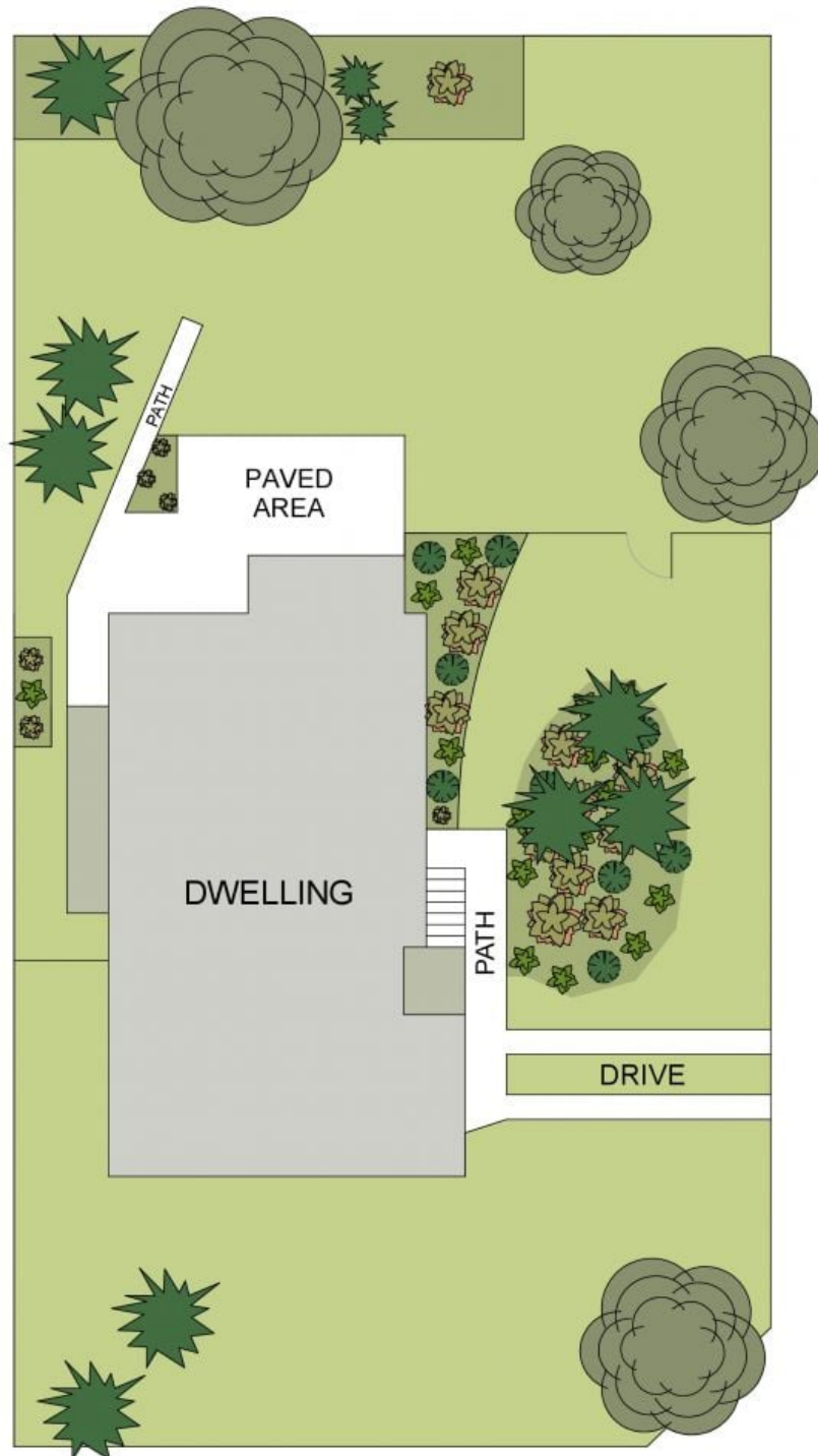
SITE PLAN (512 sq m Approx) Scale - 1:130