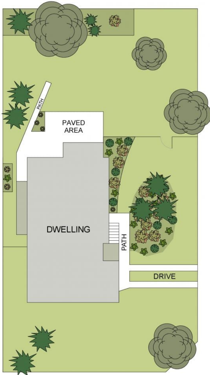
SITE PLAN (512 sq m Approx) Scale - 1:130