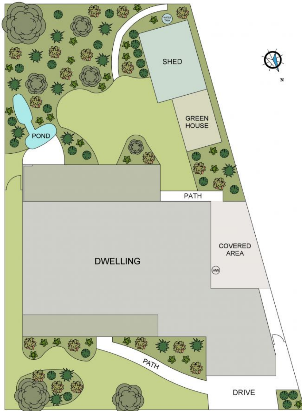
SITE PLAN (656.6 sq m Approx) Scale - 1:145