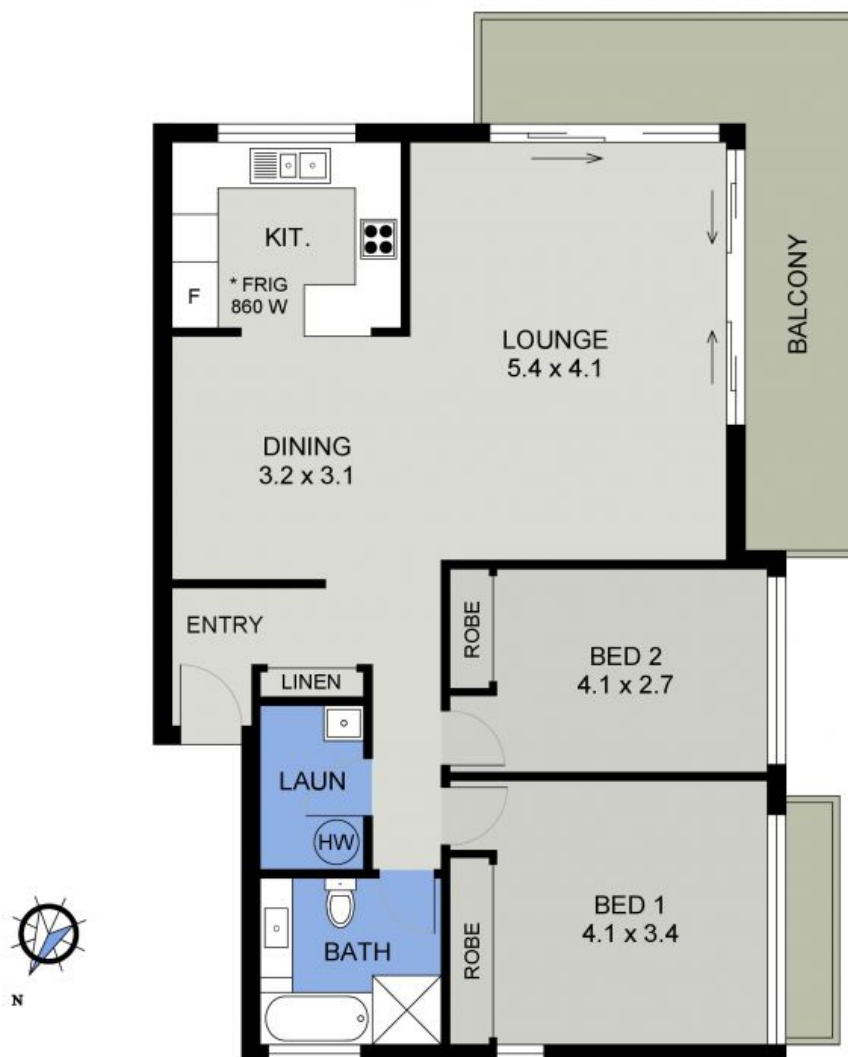
FLOOR PLAN (90 sq m Approx) Scale - 1:75