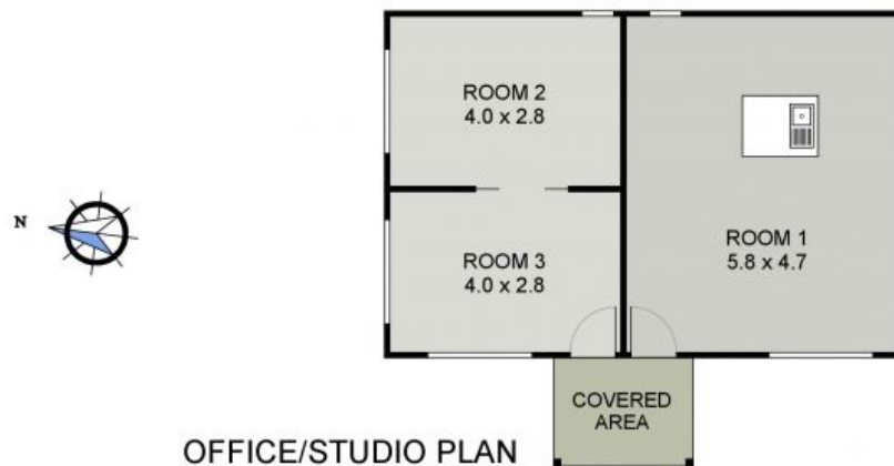
OFFICE/STUDIO PLAN (54 sq m Approx)