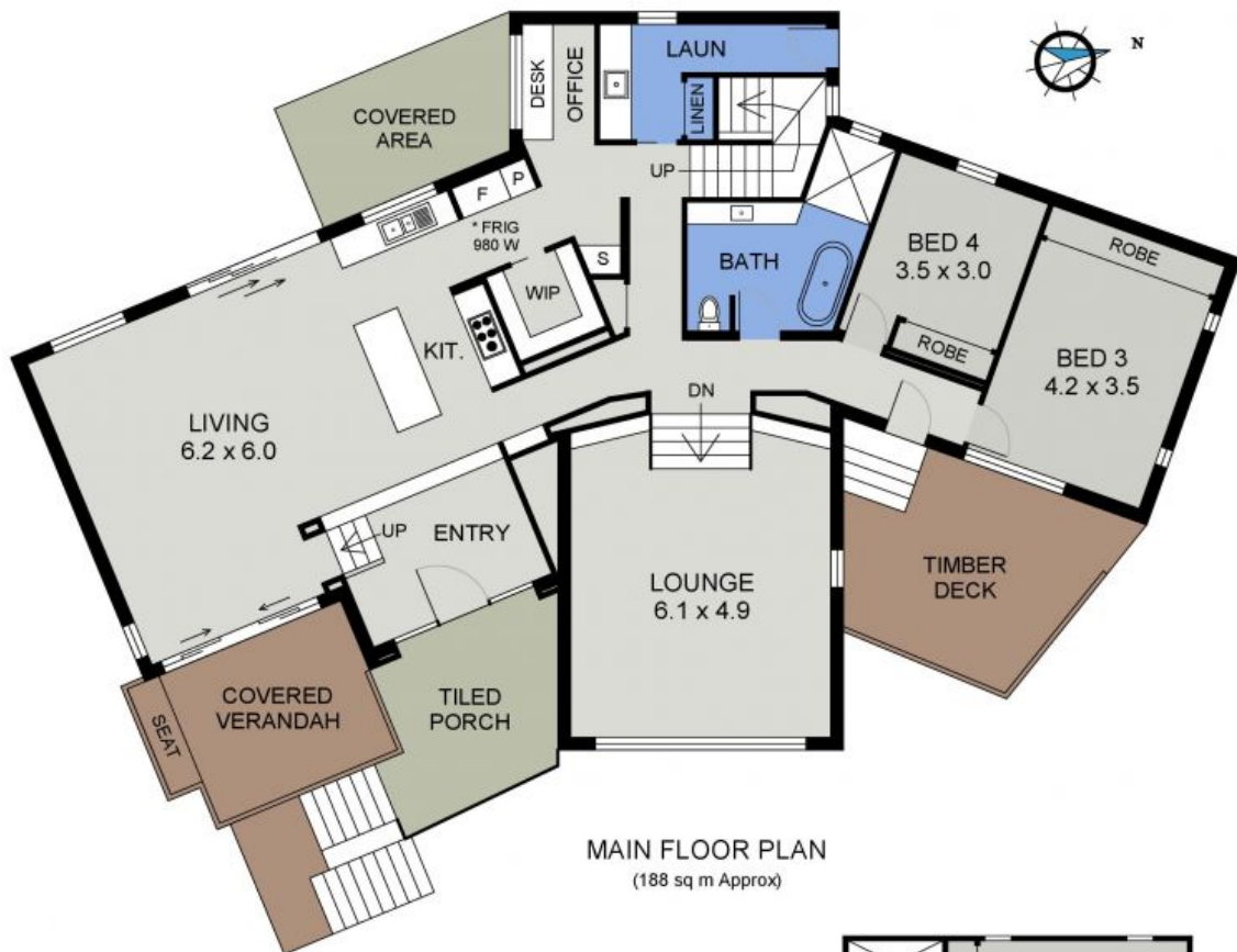
MAIN FLOOR PLAN (188 sq m Approx)