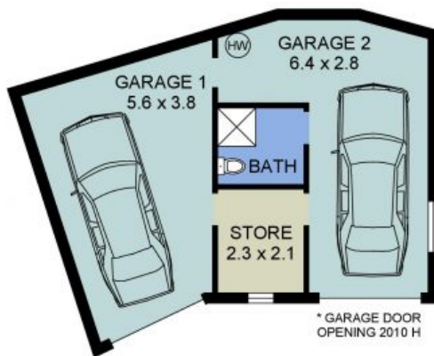
LOWER FLOOR PLAN (56 sq m Approx)